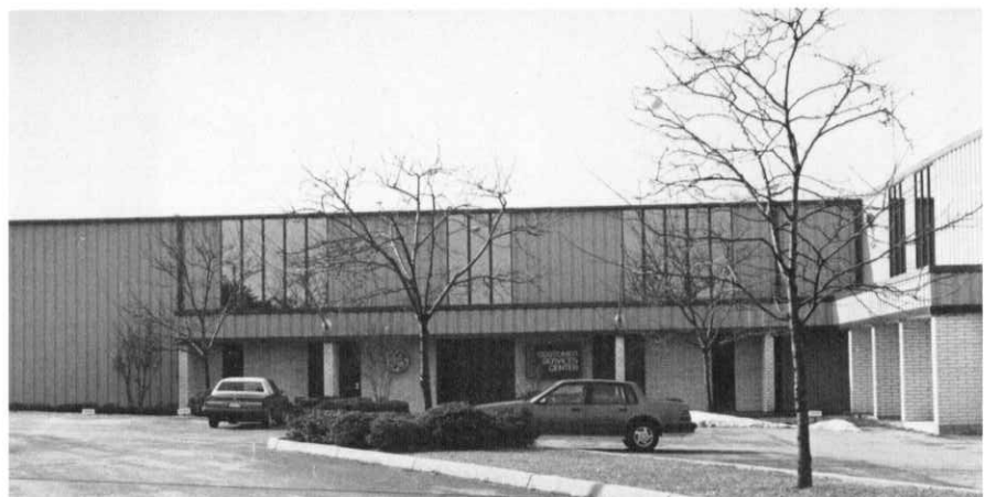
Customer Services Center, Lynchburg, Virginia