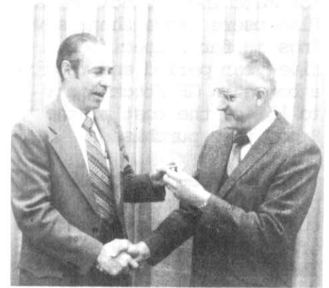
25TH GE ANNIVERSARY OBSERVED BY MANAGER OF TECHNICAL PUBLS.